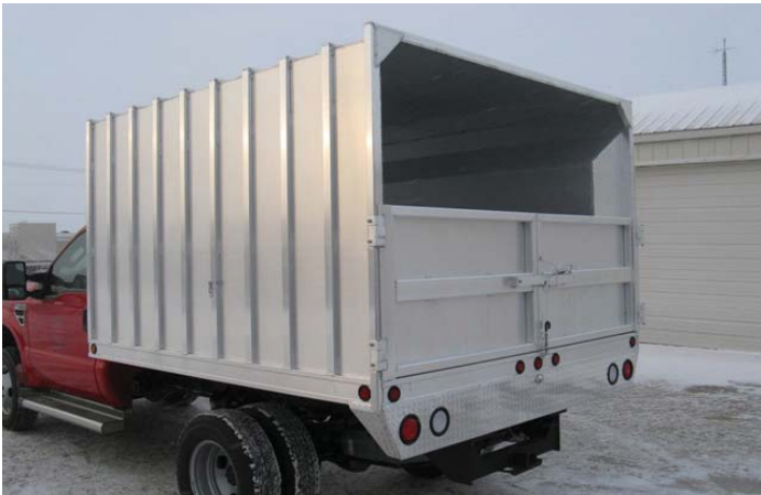
17. Bed capacities up-to 12 ton are available. Our extruded flooring offers easy dumping. Permanent solid sides come in a variety of heights and in either smooth, extruded, or diamond plate material.