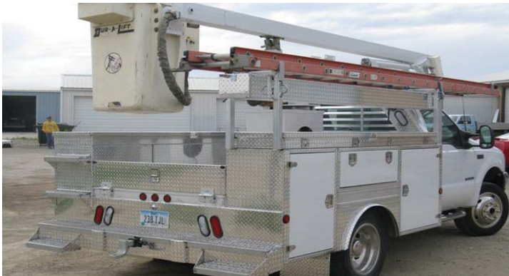
6. Special use service trucks can be designed to fit your need. ALUM-LINE has designed a variety of bodies for all your contractor needs.