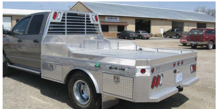
8. Another choice of sides can be matched to almost any inch increment you desire. All hitches used with ALUM-LINE beds are attached to the frame of the truck.