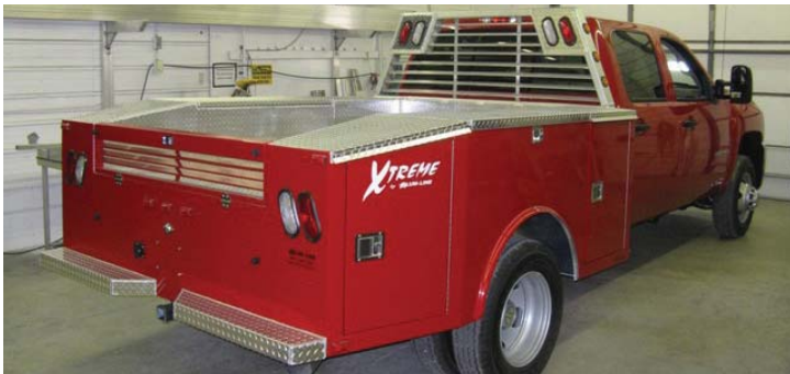
12. The "Xtreme" body. Our combination service body and Pro-Hauler gives you a stylish body with lots of storage.