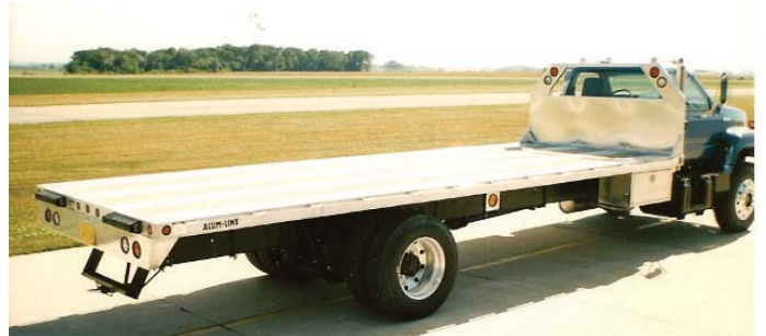
14. ALUM-LINE will build beds up-to 24' in-length and 20,000 lb capacities. Special strength features include: 1/2" thick outside rail, 3" I beam, 1/4" wall cross members on 12" centers, and 1 1/4" extruded flooring. Put our bed to the test... You will be very satisfied. All types of loading ramps available.