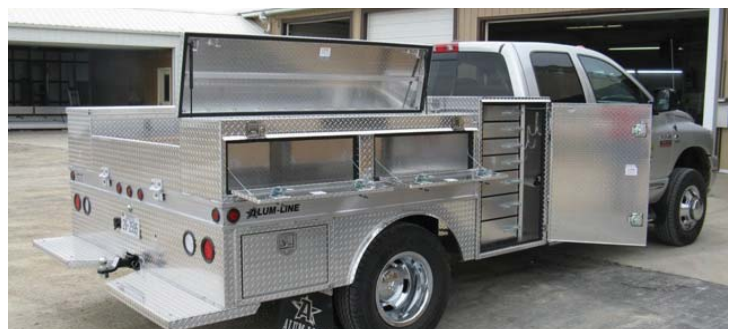
3. Component body. With our special front corner cutouts, you can have tall upright boxes yet the strength of a platform body. Extra storage includes removable top boxes and small boxes behind the wheels. A lower price alternative to a service body.