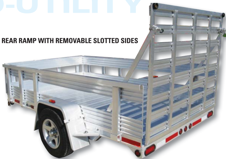
REAR RAMP WITH REMOVABLE SLOTTED SIDES