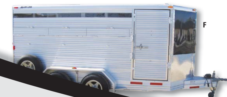
B Gooseneck 15' long x 6'10" wide, standard air spacing and aerodynamic nose