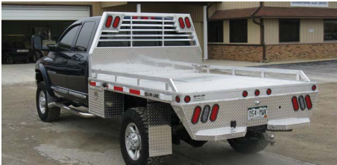
11. We will build any size bed to fit your dimensions. Light weight beds are an ideal alternative to pickup boxes and give you more universal uses. Pictured with tapered rear corners.