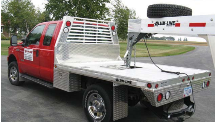
10. Standard package includes open window bulkhead, light package and stake pockets. Everything you need for a classy look. Popular options include louvers and lights, rub rail and under side boxes.