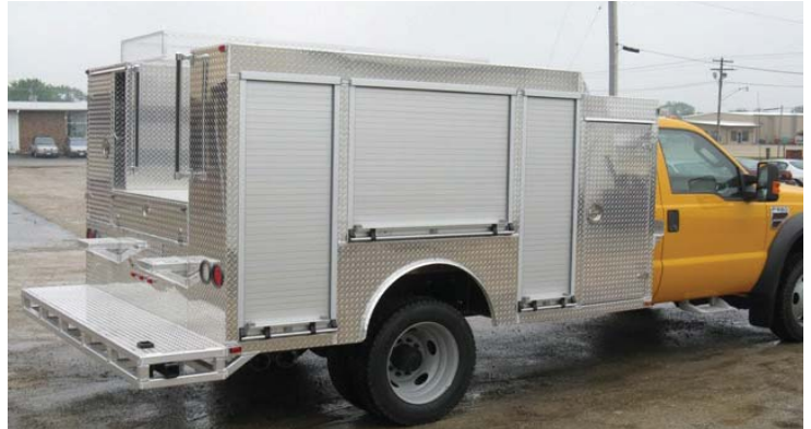
19. One of our most popular set ups. Compartment height at 40" with over-head ladder rack and step bumper. Other popular options include 4" deep flip top compartments on top, adjustable shelving, slide out trays, painted doors and much more. All models available in smooth or treadbrite aluminum construction.