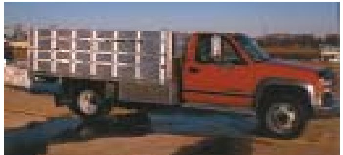
15. Truck bed with 36" high stake rails. Stake racks are available in any height or in solid sides. Sides are light weight and are easy to install or remove. Rear doors can be pull-out or swing-out design. Used with rub rail with stake pockets.