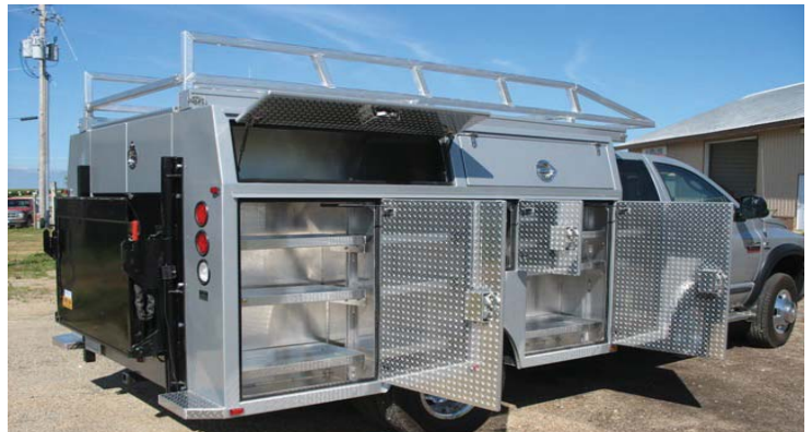
21. All types of customizing available including shelving, transverse compartments, roll out trays, double pan doors, door stops, special latches, hanging hardware, and interior lighting. Our service bodies have been used and approved by the U.S. Army.