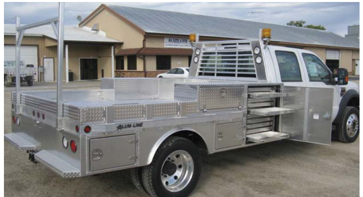
2. Equipped with optional above bed tool boxes, upright front tool boxes, rear step bumper, louvers and short sides. You can build a body your way.