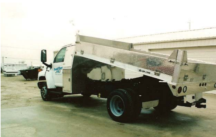
18. Special dump body set up using a "Back Pack" behind the cab. "Back Packs" provide extra storage for large tools, shovels, etc. Please note the hinged sides for multiple use.