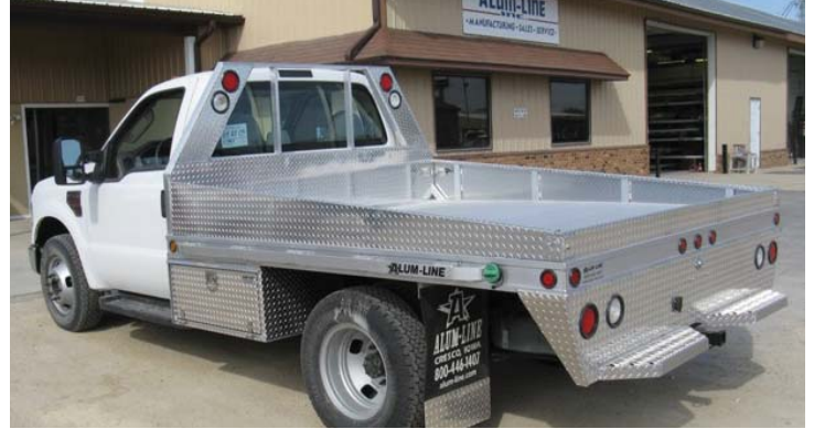
7. Our most popular truck bed package. Lighted bulkhead, tapered sideboards, underbody tool boxes, mud flaps, and fifth wheel trap door.