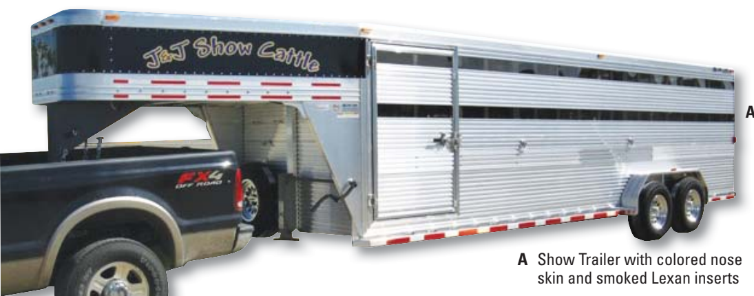
A Show Trailer with colored nose skin and smoked Lexan inserts

ALUM-LINE Trailers Are Built for a Lifetime of Use