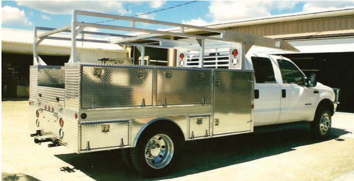
5. Overhead ladder racks can be made permanent or removable. Side boxes are available with double drop-down doors. Large front storage boxes.