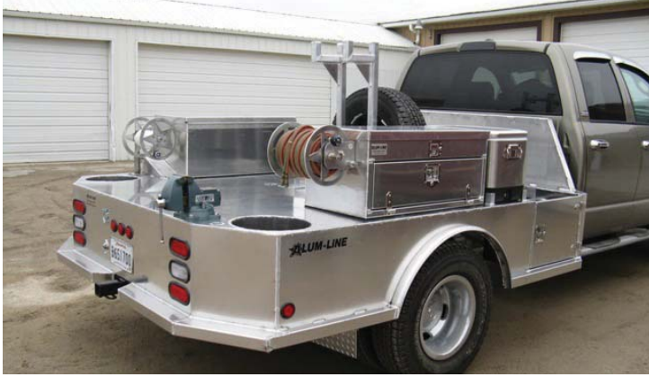
4. Beds can be designed with a frame cut-out to attach special use equipment. Side boxes can be built any height. Beds built tough enough for medium-duty trucks.