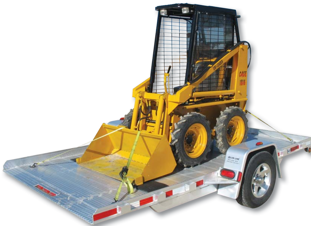
TILT DECK WITH REMOVABLE SOLID SIDE

ALUM-LINE Trailers – Built for a Lifetime of Use