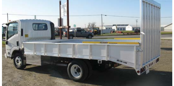
13. Truck Beds can be designed for any special needs. The above bed is equipped with fold-down ramp..