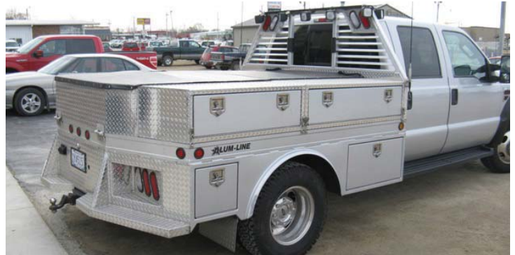
1. Truck bed with boxes on top and below. Finished with tapered rear corner, side skirting, louvers and lighted bulkhead.