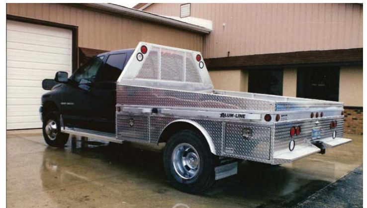
9. Give your bed a personal touch. Extra boxes, rub rail, wheel flairs, plus more. All types of lengths and widths available.