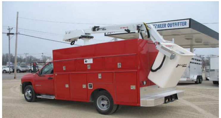
20. Service body with extra height. Multiple compartments per side and finished 1.125 smooth aluminum painted sides. Rear step bumper and rolled fender flares. More information is available on our complete line.