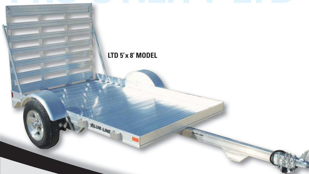
LTD 5'x 8' MODEL