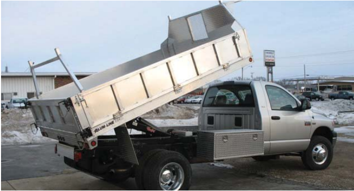
16. ALUM-LINE dump body platforms are heavy duty. Special strength options include; 1/2" thick outside framing with 1 1/4" extruded flooring. Channel long sills and heavy duty bulkheads complete the package.